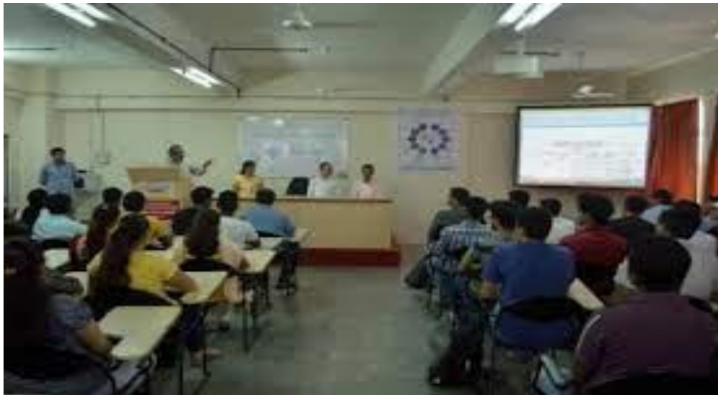
Entrepreneurial Skill Development, Training, and Placement