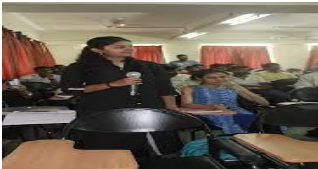
Entrepreneurial Skill Development, Training, and Placement